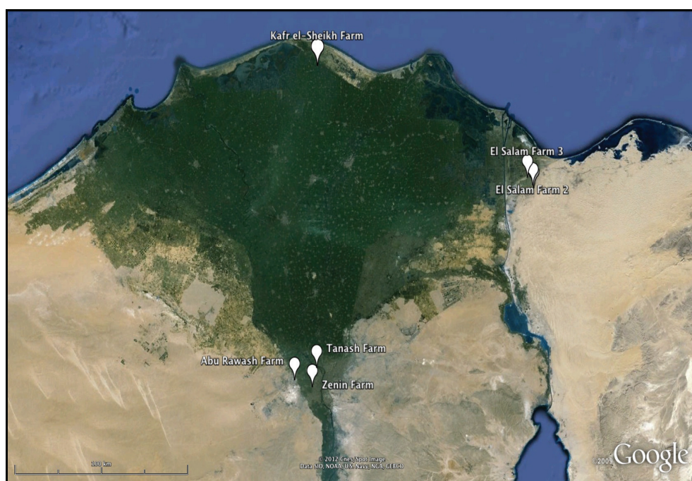
Fig. 1. Location of the three soil samples collected from three Governorates

Samples from three different soil areas (Fig. 1) were subjected to irrigation with low quality waters either single, mixed sewage effluent or agriculture drainage water. The 1 st soil sample was collected from Sinai Governorate where the soil ecosystem was irrigated for 33 years with mixed Nile and drainage water of El-Salam canal. The 2 nd soil sample was collected from northern Delta (Kafr-el-Sheikh Governorate) where the soil ecosystem was irrigated for eighty years with drainage water combined with sewage and industrial effluents from Kitchener drain and the 3 rd soil sample was collected from Giza Governorate (Kombera site) where the soil was irrigated for thirty-five years with sewage effluent from EL-Libeny drain. Some physical and chemical characterizations of used soils are presented in Tables 1 and 2.