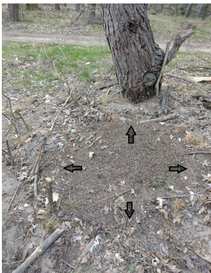
Fig. 1. Location of the anthill with the wind rose