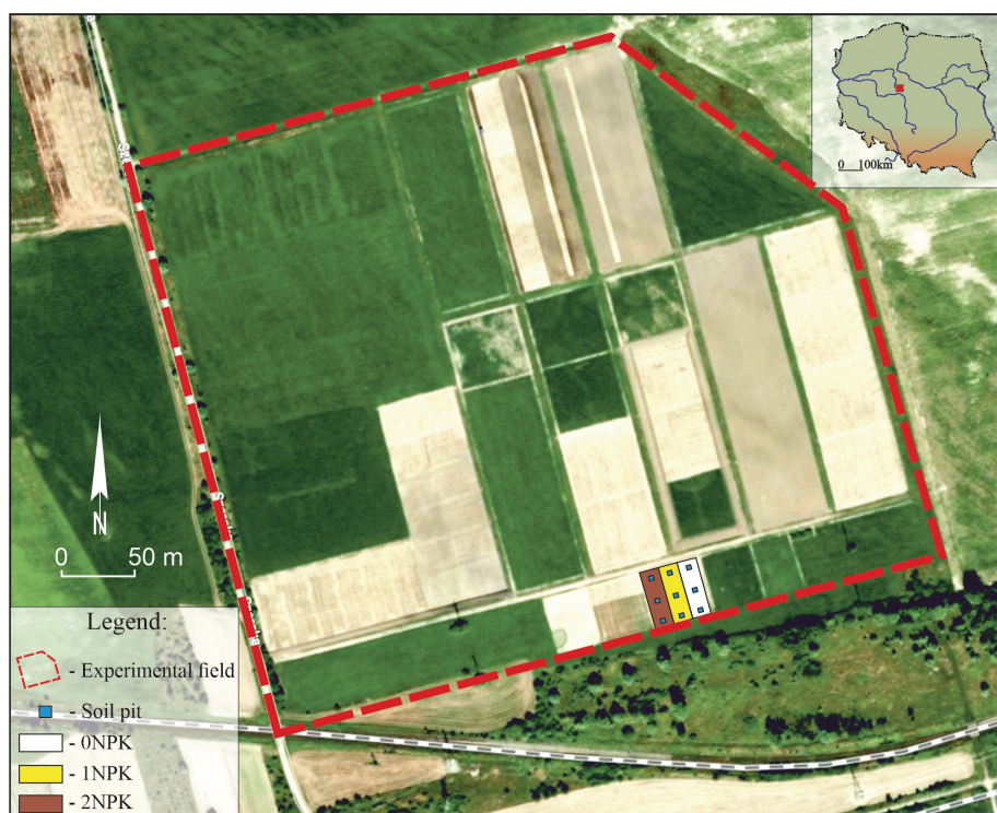
Fig. 1, Location of examined points